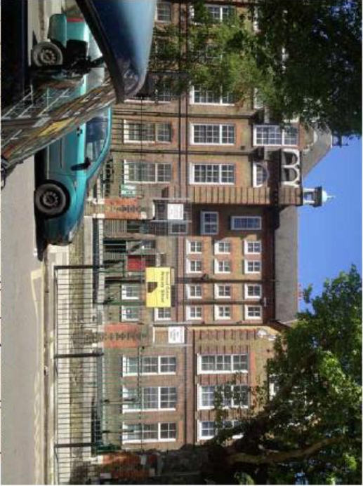
5. view from Woodstock Road of projecting wing and hipped roof, crowned by cupola