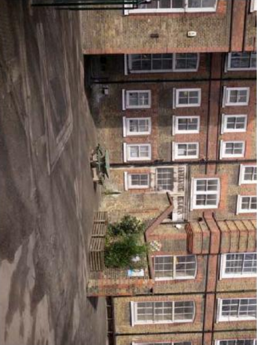
8. view of recess at southern end of building