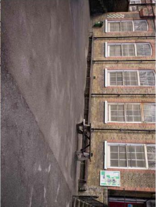
5. view of slightly projecting five bay centre piece