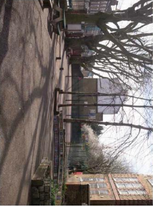
7. view from playground back to ball court and Woodstock Road MO25/Ph_02