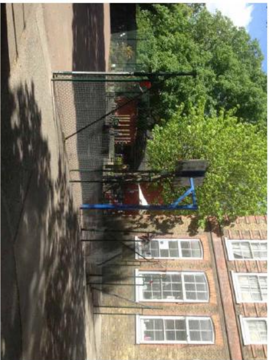
9. view from Woodstock Road through ball court and projecting gabled wing 11. view from playground back to ball court and Woodstock Road MO25/Ph_03