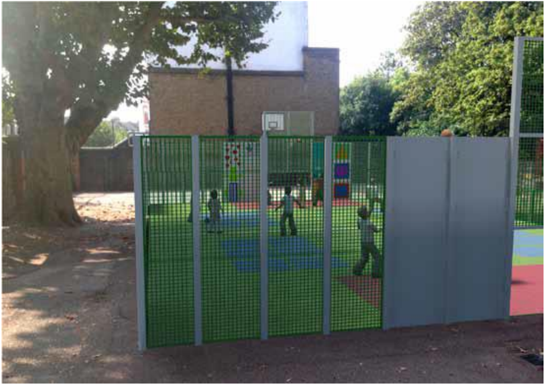
Visualisation of new ball courts